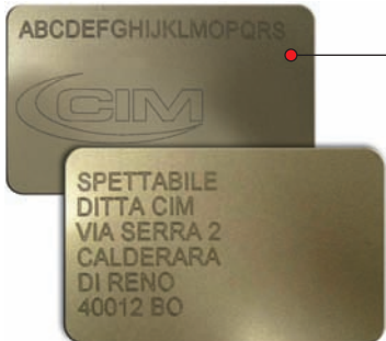
Text 49 characters Font arial 18 - 6 rows Standard quality 164 s. Draft quality 99 s.